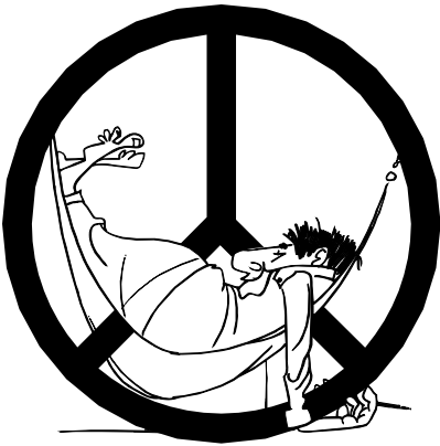
Rest In Peace