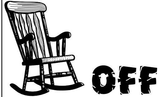
Off Your Rocker