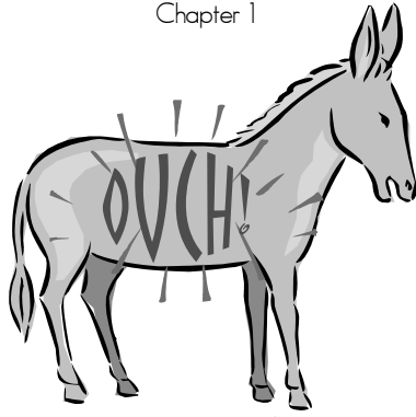
Pain In The Ass