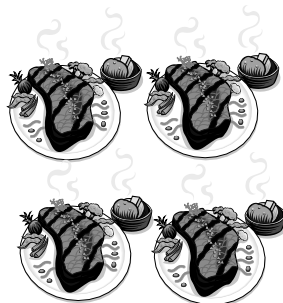
Leftovers for Dinner