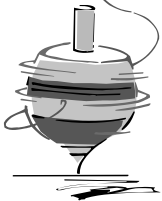
Over the Top